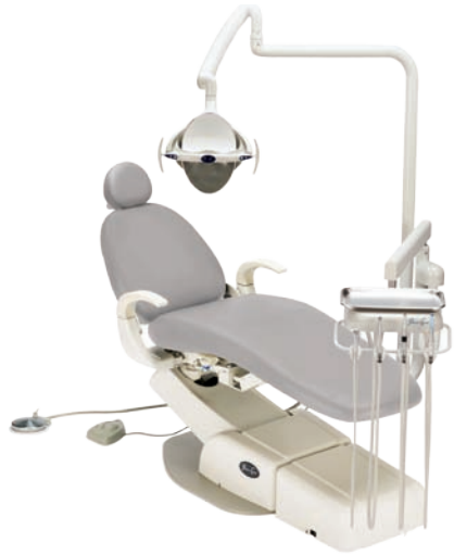
Alliance Delivery System Swing-Mount Delivery System